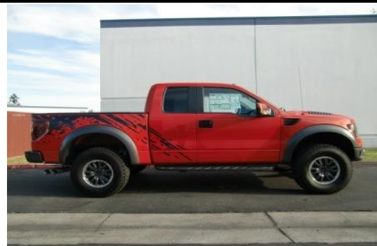
Reinstall tires and wheels torque to factory spec and align vehicle. Congratulations and enjoy!