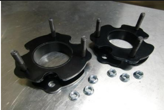
Shown, 66-2055 upper strut extensions and hardware.

Please read instructions thoroughly and completely before beginning installation. Check www.Readylift.com for any installation instruction updates Installation by a trained mechanic is recommended.