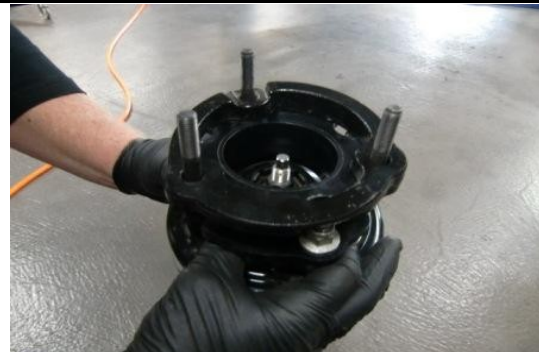
Place wedge on top of the 66-2055 spacer in its original configuration. Note the coil-over will now be installed 180 degrees opposite of the original position.