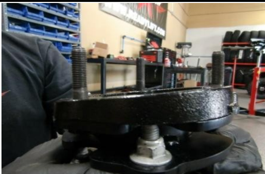
Up close side view of properly installed extension and OE wedge. Reinstall coil-over into vehicle and reassemble in reverse order and tighten to OE specs.