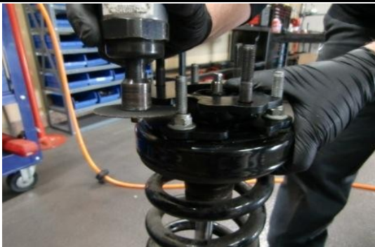
With a cutoff wheel or appropriate tool trim OE mounting studs just under flush with the top of the 66-2055 as shown.