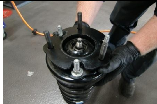
Place upper strut extension on top of coil-over assembly, reinstall and tighten to factory spec using OE hardware.